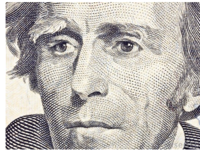
Andrew Jackson: Indian-Killer

Deuteronomy 28:47 Because thou servedst not the LORD thy God with joyfulness, and with gladness of heart, for the abundance of all things; 48 Therefore shalt thou serve thine enemies which the LORD shall send against thee, in hunger, and in thirst, and in nakedness, and in want of all things: and he shall put a yoke of iron upon thy neck, until he have destroyed thee.