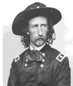
Lt Colonel Custer

Before Chivington and his men left the area, they plundered the tipis and took the horses. After the smoke cleared, Chivington's men came back and killed many of the wounded. They dressed their weapons, hats and gear with scalps and other body parts, including human fetuses and male and female genitalia.